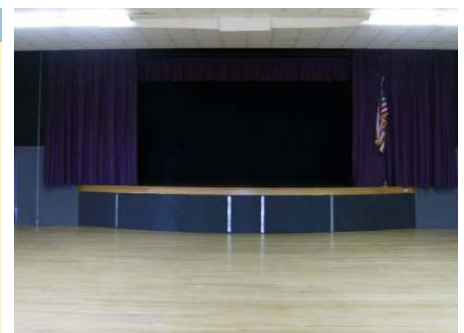
James Woody Community Center Auditorium