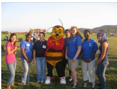
Volunteens at Apple Valley Idol