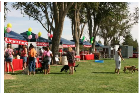
Paws N' Claws Pet Fair