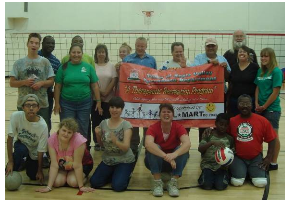
Special Apples Volleyball