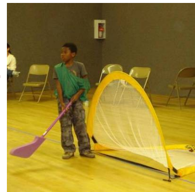
Special Apples Floor Hockey

*Program/League started in the month of June and continued to be offered through July. Attendance figures were included in the June report.