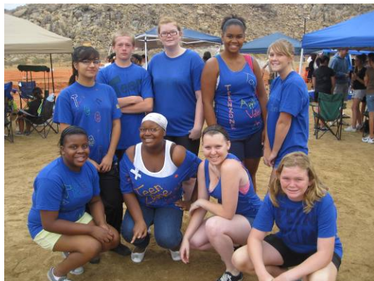
Teen Zone members competing at Mud Fest