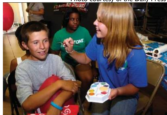
Teen Zone members working at National Night Out