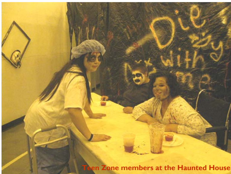
Teen Zone members at the Haunted House