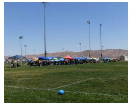
Lenny Brewster Sports Center