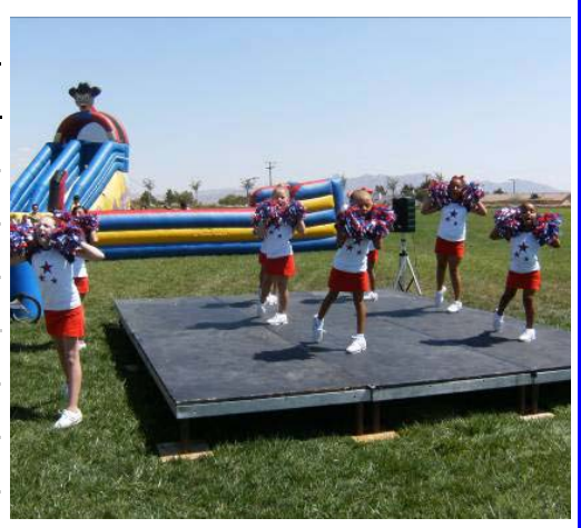
Pom Pom class