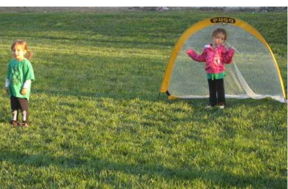
Pee Wee Soccer