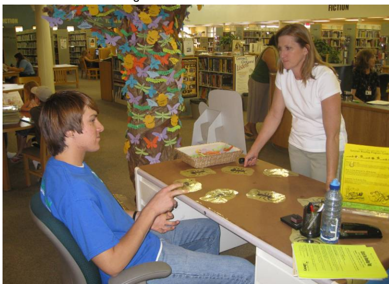
Teen Zone members at the Library