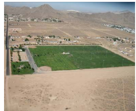
Lenny Brewster Sports Center