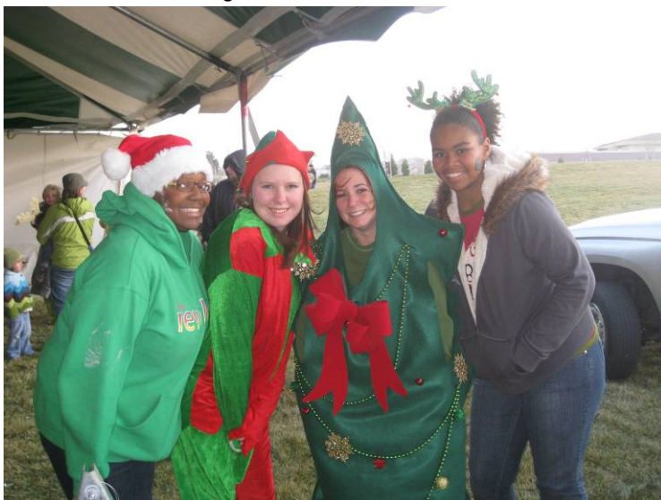
Teen Zone members at the Winter Wonderland