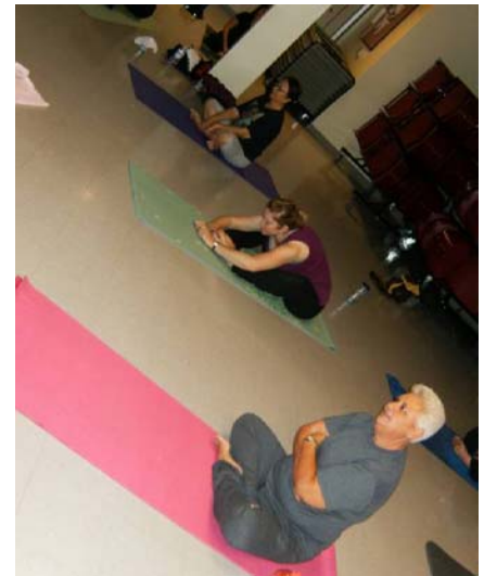
Yoga at the Town Hall Recreation Center