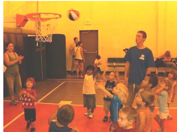
Pee Wee Basketball