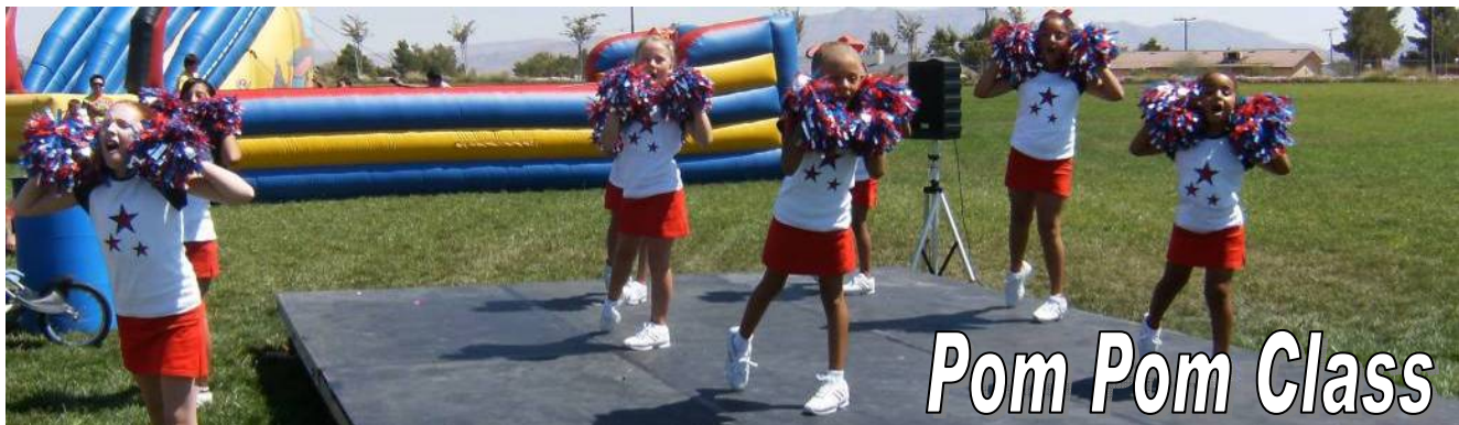
Pom Pom Class