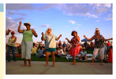
Sunset Concert Series