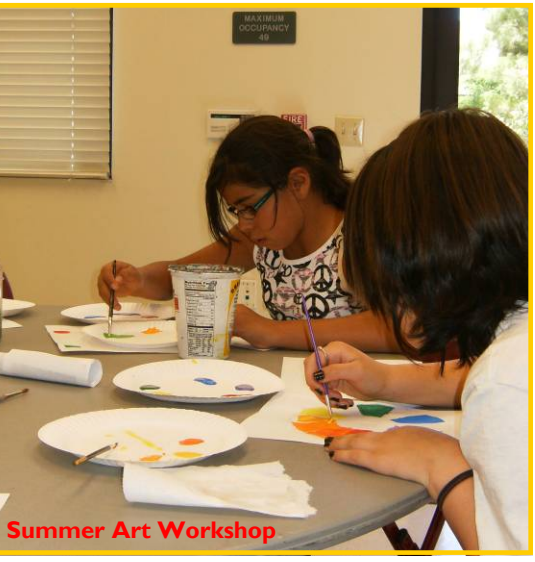
nap - Figures not applicable