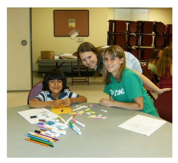
nap - Figures not applicable

Teen Zone members started offering tutoring sessions in reading, writing and math to kids, grades 1st - 5th this month. The tutoring sessions are offered weekly, free of charge so students can keep up on their academic skills during summer vacation.