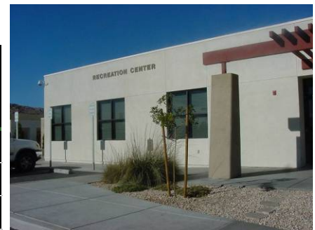
Town Hall Recreation Center