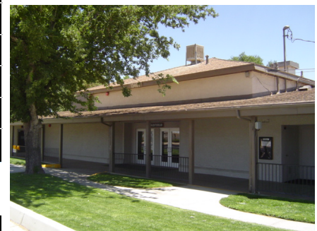
James Woody Community Center