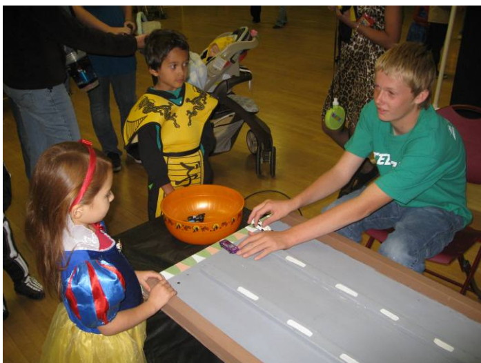
Teen Zone members at the Kiddie Carnival