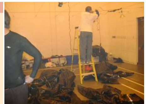
Haunted House set up