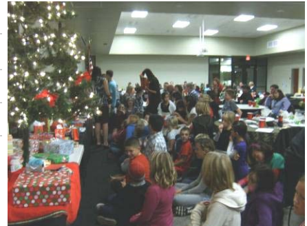
Apple Valley WAVE Christmas Party at the Conference Center