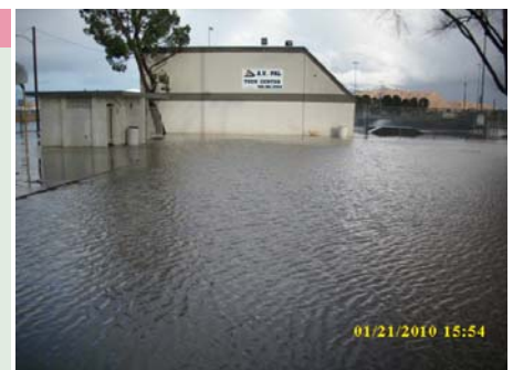
Teen Center at James Woody Park