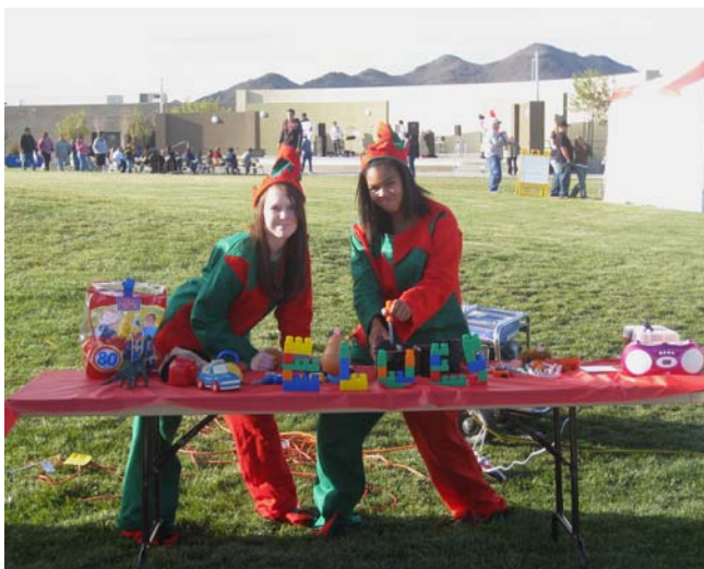
Teen Zone members at the Winter Wonderland