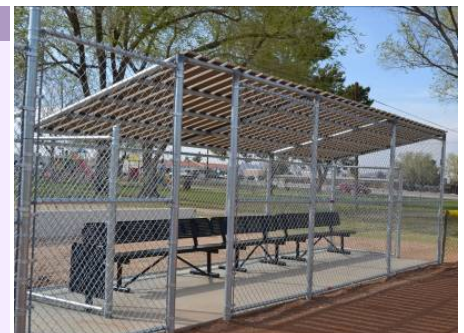
New dugouts at James Woody Park