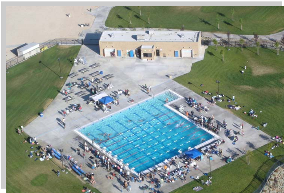
Civic Center Park Aquatic Center