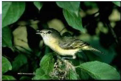
Least Bell's Vireo