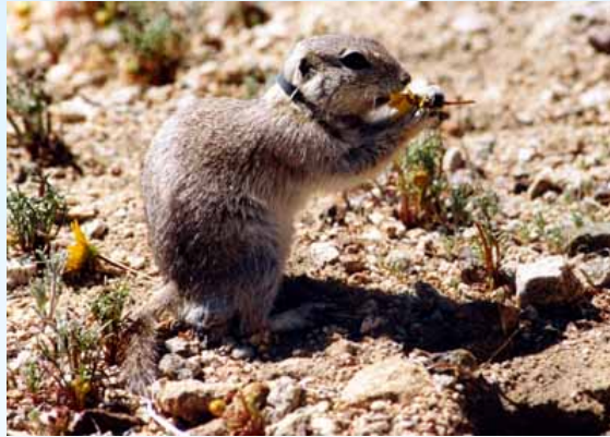
Mohave Ground Squirrel