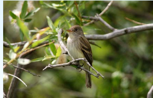
Southwestern Willow Flycatcher