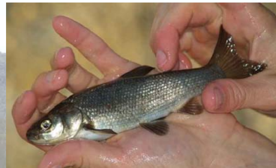
Mohave Tui Chub