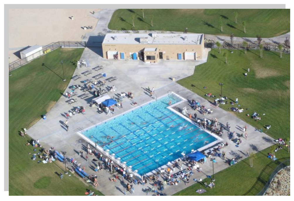
Civic Center Park Aquatic Center