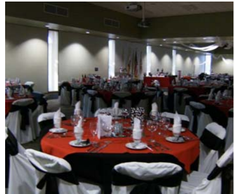
Conference Center set up for the Animal Services Fur Ball event.