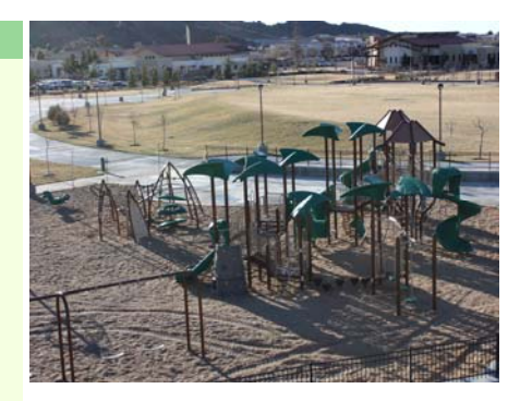
Civic Center Park playground

Installed new benches, picnic tables and trash receptacles to accompany the new playground at Civic Center Park.