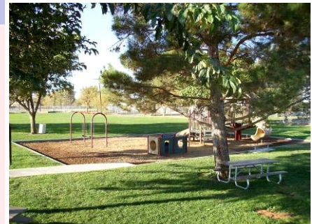
Yucca Loma Park