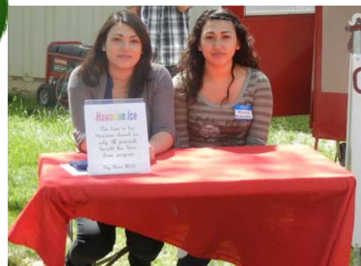
Teen Zone volunteers at the Easter Eggstravaganza event.