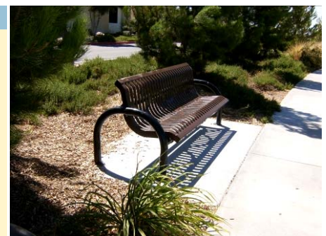
New benches at Civic Center Park