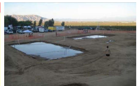
Horsemen's Center all ready for Mud Fest.