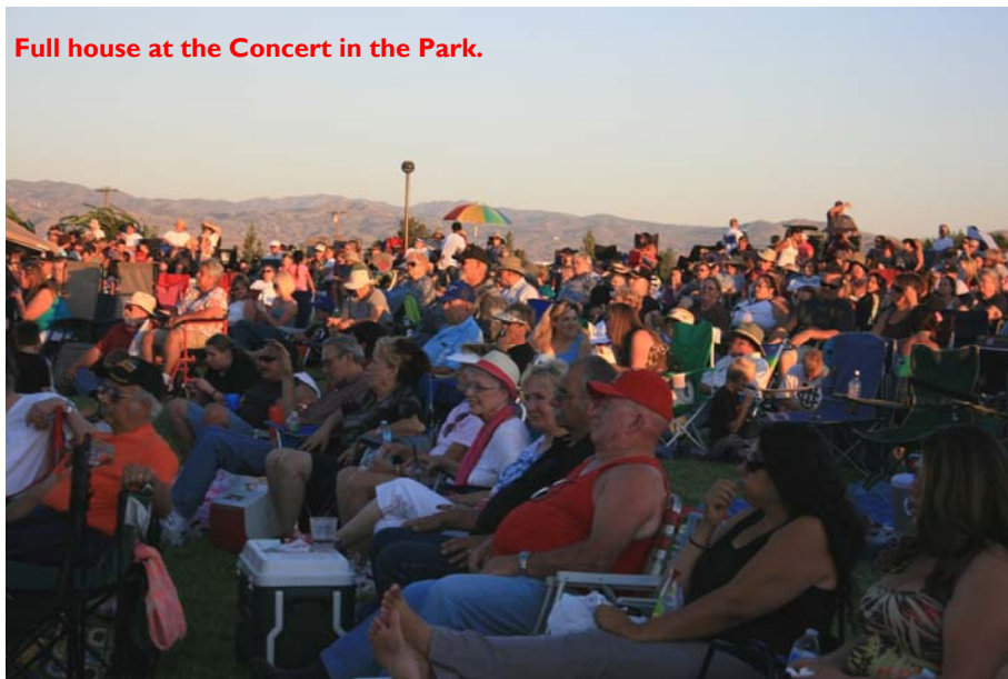
Full house at the Concert in the Park.