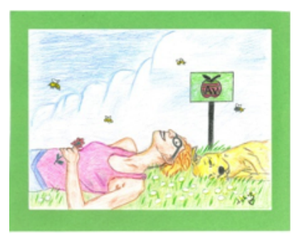
Calendar Cover Art

When the request for submissions from talented artists, photographers and writers went out earlier this year, more than 400 people answered the call! From those submissions, 19 entries were chosen to be featured in the 2012 Town of Apple Valley Community Calendar that will be available free at Town Hall beginning in December. The calendar includes listings of Council and Commission meetings, special events, Town Hall closures and a two-page Town services guide that will make this a resource you won't want to be without. We are grateful to Burrtec Waste Industries for their significant contribution toward this project, as well as Apple Valley Ranchos Water Company for their support. For a list of contest winners, visit www.GreenAppleValley.org.